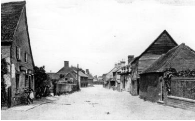
(Above: Langford High Street in 1900. 5 )

Owing to the weakening of the straw plait industry and the inability of my mother to help in this, through her constant ill-health, my father became a farm labourer and received the incredible sum of two shillings a day in the winter and two shillings and two pence in the summer. I have known weeks, in wet weather, when his wage was not more than six shillings.